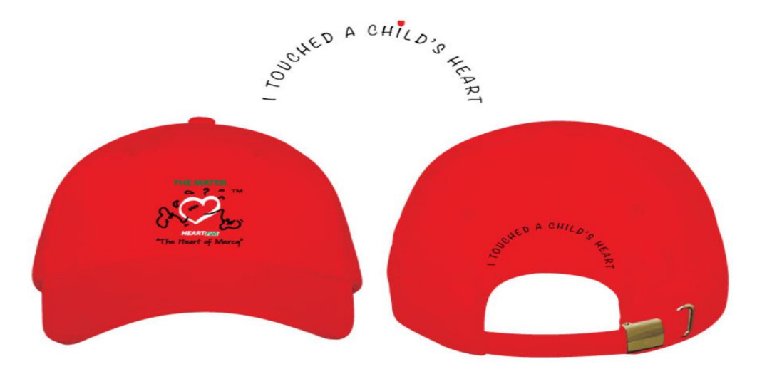
Note: Caps artworks to apply on the three colours (Red, Black & Jungle Green).